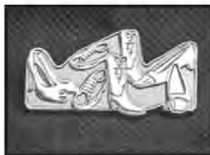
Step into the Future Pin