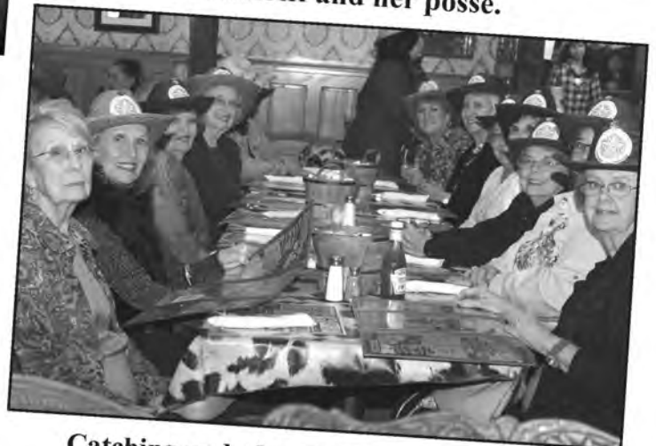
Catching up before being served dinner. The cowboy hats were not optional.