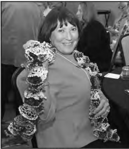
Door Prizes were fun