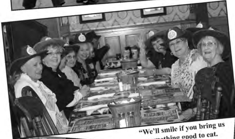
"We'll smile if you bring us something good to eat."