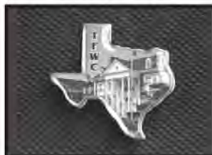
TFWC Headquarters Pin $13.00 Each