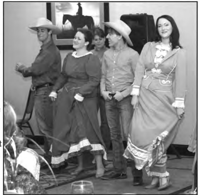
Cast members from TEXAS (above) entertained an appreciative audience (below).