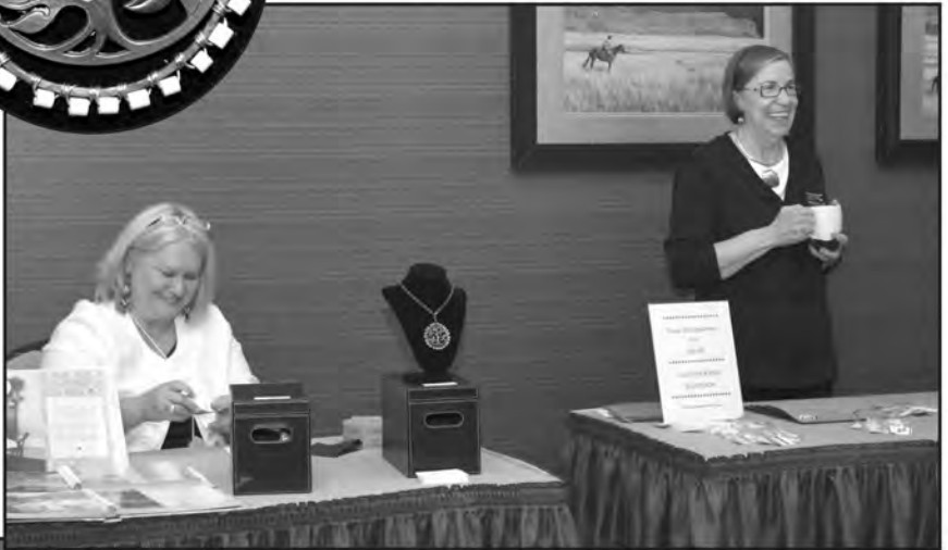
First time attendees - WELCOME & Come Back!!