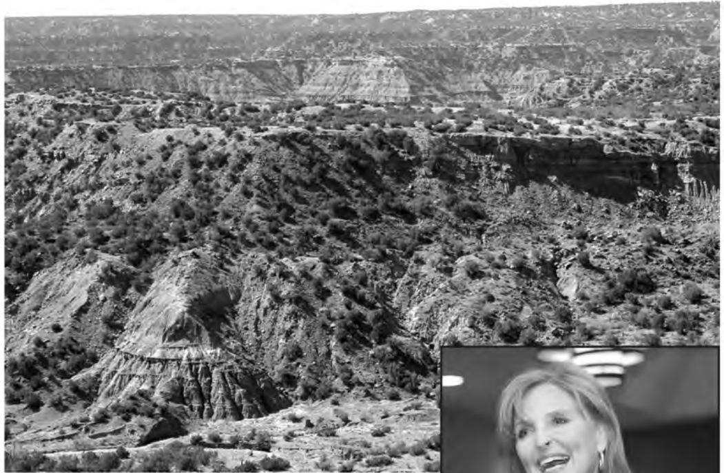
Thursday in Beautiful Palo Duro Canyon (above)