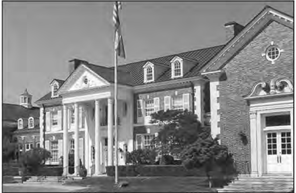
TFWC Headquarters 2312 San Gabriel; Austin, Texas 70785-5014.