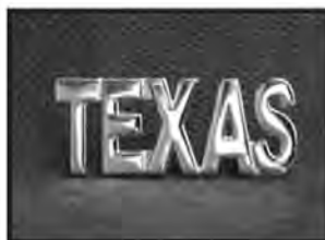
Gold Texas Pin