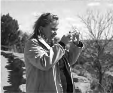
Photo opportunity of Palo Duro