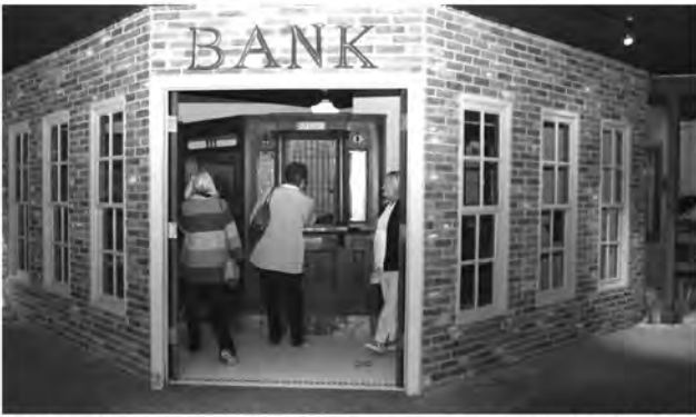
Panhandle - Plains Historical Museum was a wonderful place to learn about our heritage.