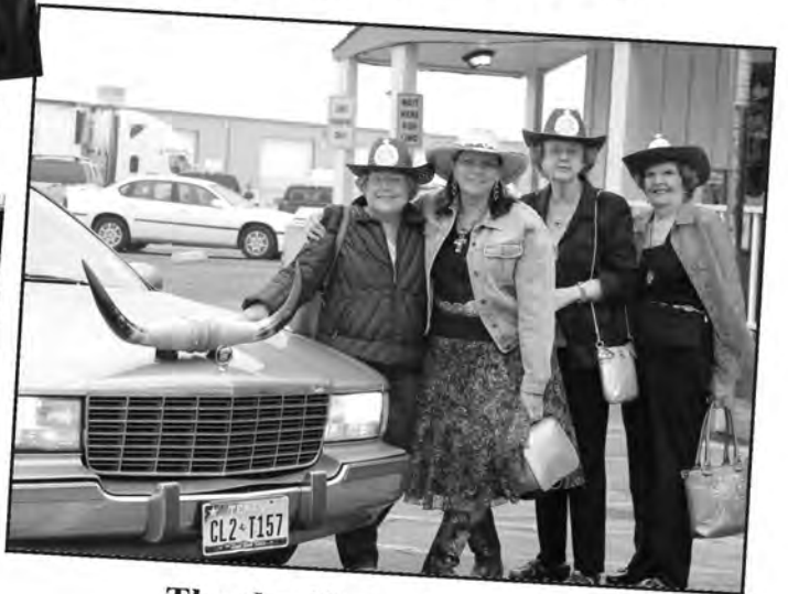
The sheriff and her posse.