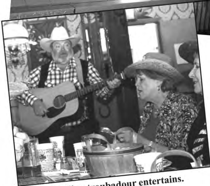
Strolling troubadour entertains.