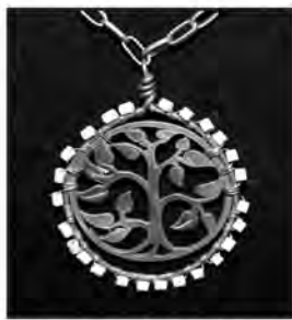
She crafted this!