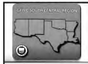
SCR Computer Mouse Pad $10.00 Each